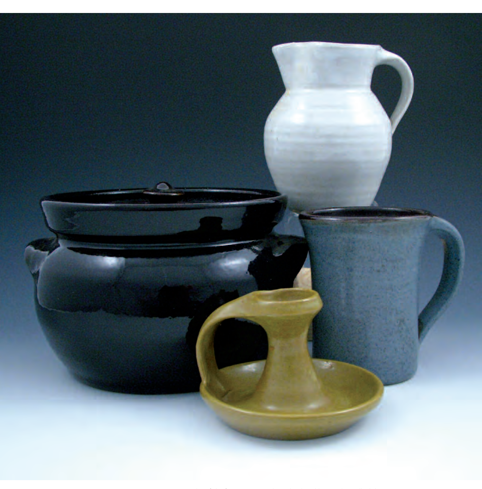
FIGURE 5. Examples of the four stoneware glazes developed by David Farrell while serving as journeyman at Jugtown Pottery. Clockwise: Covered bean pot in dark brown; pitcher in white; mug in Beaver Brook Blue with inside dark brown; candle saucer in olive green. These four glazes have been discontinued. (Collection of the author)