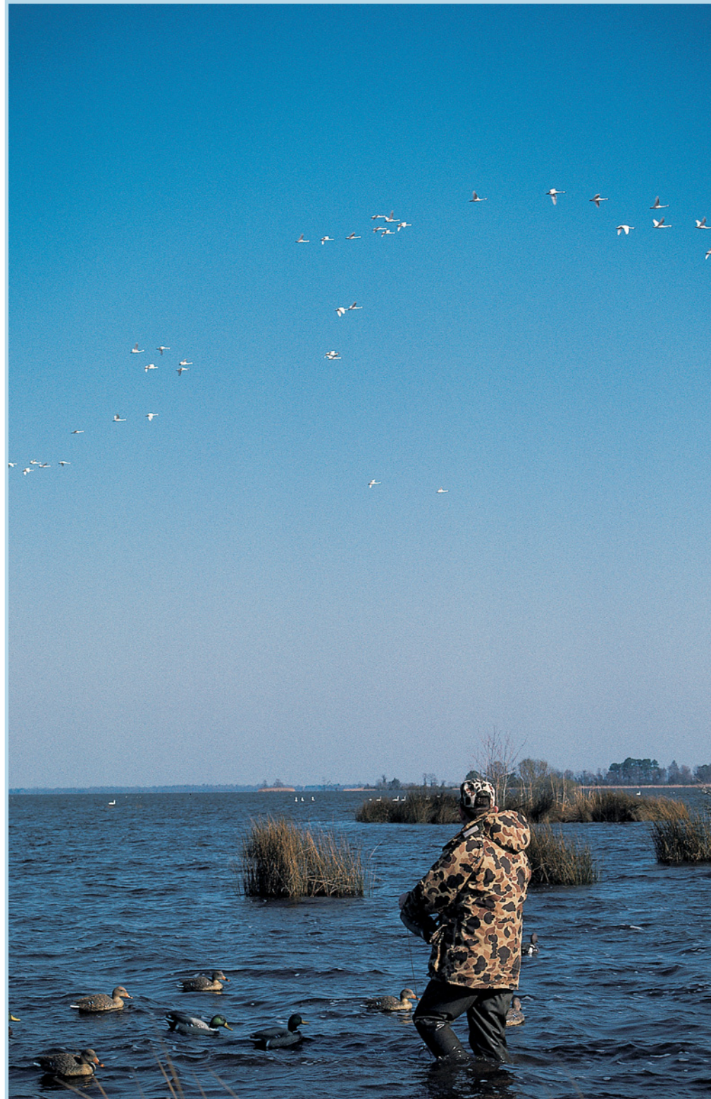
A flock of tundra swans passes over a duck hunter tending to decoys in the Pamlico Sound.

“Everybody’s gotten an opportunity, at least. It’s hard to miss such a big bird,” Clark says, “but I’ve seen a few people do it.””