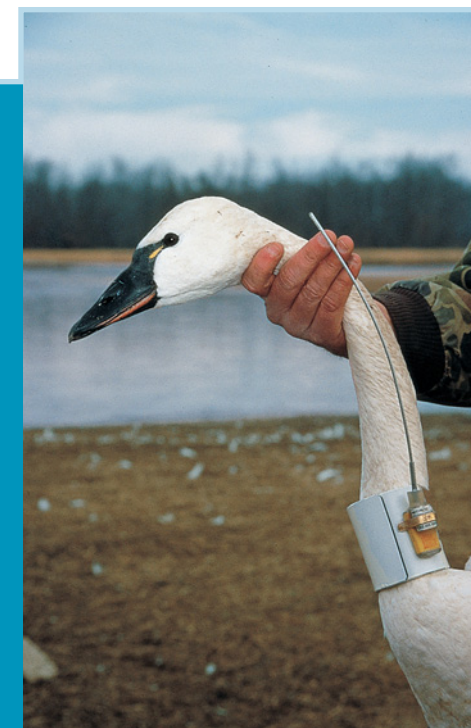
The transmitter attached around the swan's neck allows researchers to monitor the birds' migration routes with satellite tracking. Below, a wildlife biologist attaches a band around a swan's leg.